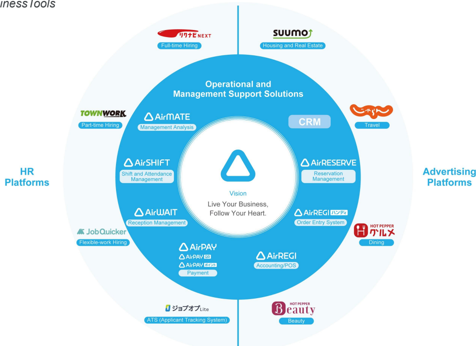
Platform of Air BusinessTools

(2) The Company estimated the number of [business locations and stores] that can use Air BusinessTools by first identifying the total number business locations and stores of small and medium-sized enterprises in Japan (using the definition used by the Small and Medium Enterprise Agency) based on the 2016 Economic Census for Business Activity conducted by the Ministry of Internal Affairs and Communications and the Ministry of Economy, Trade and Industry. The Company then estimated the number of these business locations and stores that could use Air BusinessTools by aggregating the number of all such business locations and stores operating in all industries in which there were 20 or more existing Air BusinessTools registered accounts (including non-active accounts) as of March 31, 2020. As the Company has estimated such business locations and stores based on data for 2016, it is possible that the estimated number of such business locations and stores would materially differ based on more recent data. In addition, while the estimated number of such business locations and stores that can use Air BusinessTools is based on the number of all business locations and stores in all industries in which there were 20 or more existing Air BusinessTools registered accounts, there can be no assurance that all such business locations and stores would in fact have a need for the solutions offered by Air BusinessTools .